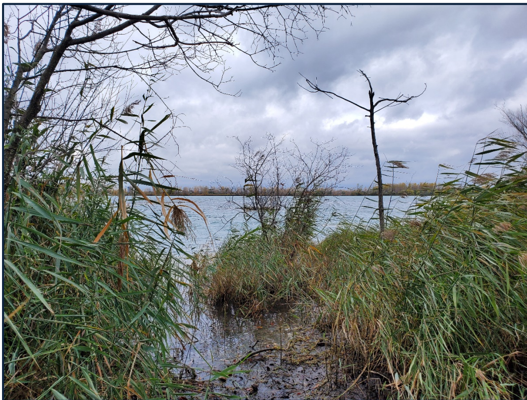
Figure 3. Location 2 During Pre-construction Monitoring at Hennepin Marsh. 10/2/2020