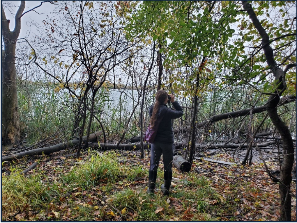
Figure 4. Location 3 During Pre-construction Monitoring at Hennepin Marsh. 10/2/2020