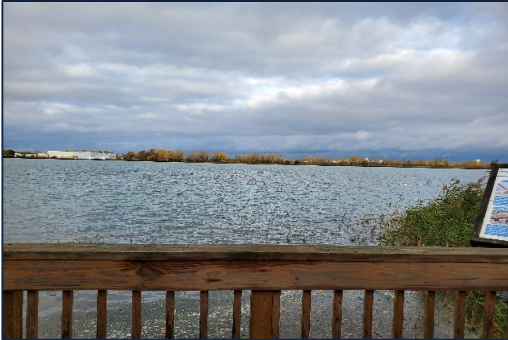
Figure 2. Location 1 During Pre-Construction Monitoring at the Hennepin Marsh Habitat Restoration Project. 10/2/2020